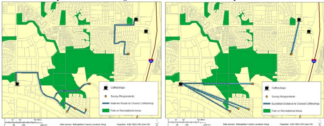
FIGURE 1 Example network and straight-line routes to nearest coffee shop.

For the purpose of comparing the actual distance to destinations (calculated in GIS) to the estimated walking times to destinations reported by survey respondents, the we converted the actual